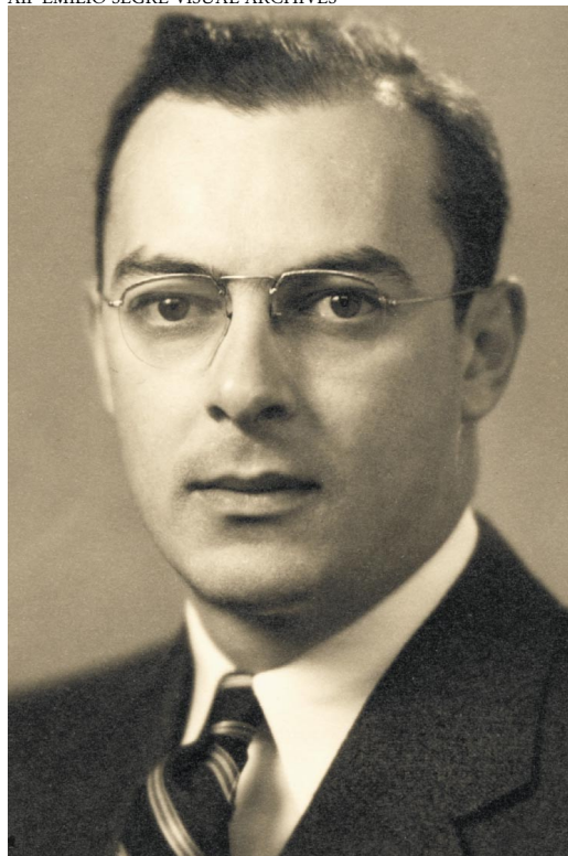
FIGURE 3. JOHN BARDEEN (1908–89) in the mid-1930s.

Bardeen was my hero. Not only because I had studied the BCS theory but also because, as a graduate student, I had been asked to give a few seminars on the background to the subject, and for that purpose had read a long review article written by him just before the new theory appeared. . . . His own reasoning was very hard to follow, and some of it, in hindsight, was clearly wrong. But it was